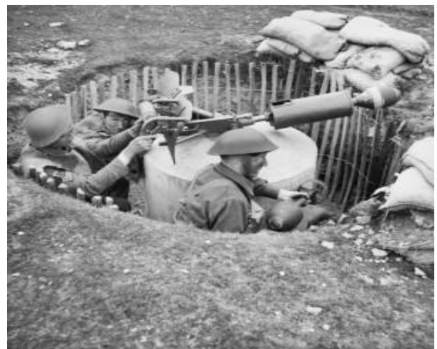
Figure 4 Home Guard soldiers operate a 'Blacker Bombard' spigot mortar during training at No. 3 GHQ Home Guard School in Shropshire, 20 May 1943

The site has high potential to contribute to the narrative of wartime Coventry, being a rare or perhaps unique survivor of the defences placed, around the city and reflects the value Coventry had for the nation's wartime efforts. Although more common originally, the site may now be a symbolic, remnant of the wider defensive network and should therefore, be recognized as such. Although the structure is legible as a spigot mortar emplacement,