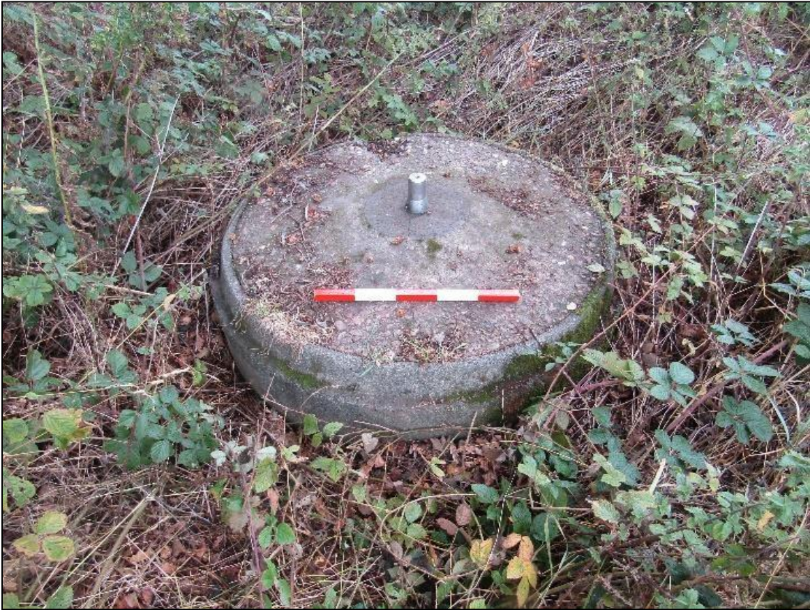
Figure 2 Spigot Mortar close-up