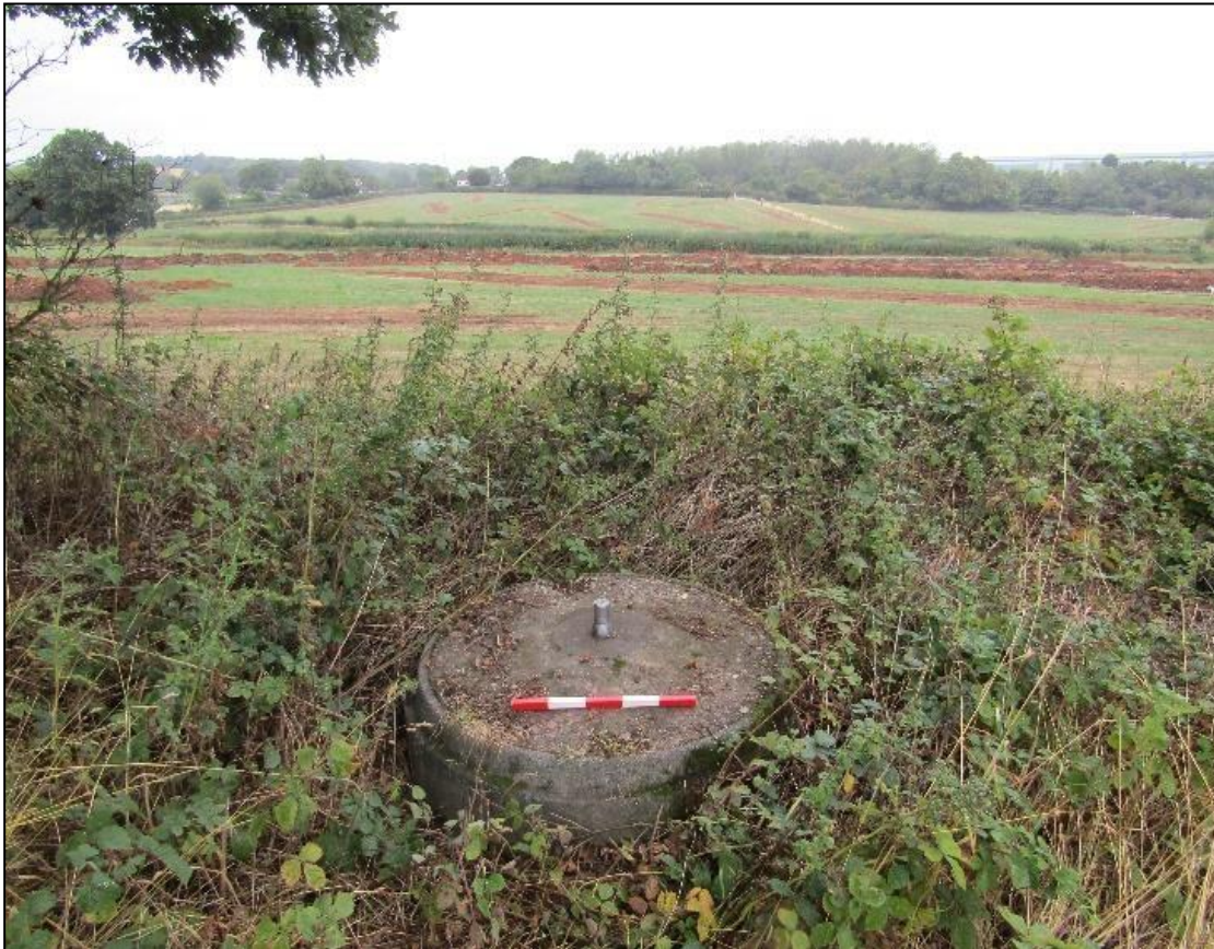
Figure 1 Spigot Mortar (looking north)

From the summer of 1940 England's defences were strengthened against the threat of German invasion and a variety of defensive structures were built across the country. These included 29mm spigot mortars which were developed between 1940 and 1941 as anti-tank defences. Designed by Lieutenant Colonel VVS Blacker they were also known as 'Blacker Bombards'. In addition to mobile units, a large number of static emplacements